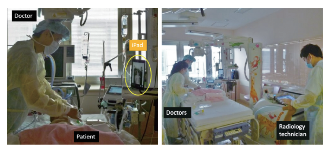
Fig. 1 Photographs showing the set-up of the portable imaging device with a flat panel detector. We usually place the tablet device to the left of the patient and reproduce the same arrangement as in the fluoroscopy room.

Before a radiograph was taken, the FPD was inserted under the patient's body, the irradiation field of the portable imaging device was adjusted, and the tablet device was placed in front of the doctors. We normally place the tablet device to the left of the patient to reproduce the same setup used in the fluoroscopy room (Figure 1). When a radiograph is taken with the portable imaging device, the image will appear on the tablet after about 4 s. The X-ray machine's preparation time between each image acquisition was 14 s.