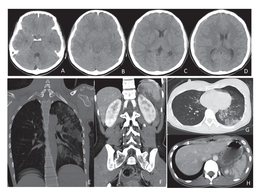
Fig. 1 Computed Tomography (CT) before the operation

Fig. 1A-D: Head CT shows right acute subdural hematoma and indicates increasing intracranial pressure. Fig. 1E-H: Body CT shows left hemopneumothorax, intraperitoneal hemorrhage, and injury of the spleen.