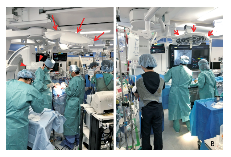
Fig. 4 Intraoperative photographs during the performance of the simultaneous craniectomy and interventional radiology (IVR) in the hybrid operating room

The disadvantages of combining direct surgery and IVR in a hybrid operating room have been previously described.<sup>2,3,10</sup> In these operating rooms, many special staff are required including a surgeon, interventional radiologist, anesthesiologist, radiological engineer, and nurse. In addition, there is a risk of radiation exposure for the surgical team, and there are issues with the cost-effectiveness of the hybrid operating room. Moreover, since hybrid operating rooms are not designed for neurosurgery, there were several specific problems when performing the combined craniotomy and IVR. First, there is limited movement of the operating table, because it only moves up and down. The head side cannot be separately raised up, and the flat table can induce bleeding from veins. Second, not all shadowless lamps were able to reach the head side because of the angiographic fluoroscopy apparatus. In our operating room, due to only one shadowless lamp being able to provide illumination, the operating field brightness was not sufficient to make it possible to observe the skull base side, where there were some bleeding veins (Fig. 4). Third, the angiographic fluoroscopy apparatus is so close to the neurosurgeons that this increases the radiation exposure (Fig. 4). Fourth, the space around the head side was more confined than that found for the IVR side. As a result, the staff and surgical equipment were all crowded together in a very small space (Fig. 4).