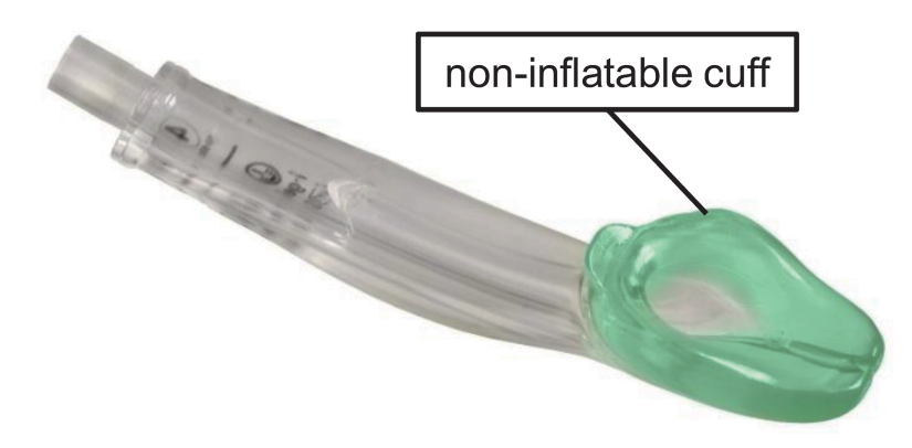
Fig. 1 Photo of the i-gel, a single-use supraglottic airway device with a non-inflatable cuff (Intersurgical Ltd., Wokingham, UK)

Supraglottic airway devices (SADs) are widely used as alternatives to tracheal intubation for airway management during general anesthesia. They are accompanied by a reduced incidence of a postoperative sore throat (approximately 5.8–49%) compared with that of tracheal intubation.<sup>1-6</sup> The i-gel<sup>TM</sup> (Intersurgical Ltd., Wokingham, UK) is a new single-use SAD with a non-inflatable cuff (Figure 1), which results in an even lower incidence of a postoperative sore throat (5–17%).<sup>7-10</sup> Overinflation of the cuff, duration of surgery, size of the device, and use of neuromuscular blockers are considered risk factors for a postoperative sore throat associated with SADs and tracheal intubation.<sup>11-13</sup> However, the risk factors associated with a postoperative sore throat induced by i-gel have not been clarified. We predicted that the same factors could be associated with an i-gel-induced sore throat. Therefore, we retrospectively assessed the risk factors for a postoperative sore throat associated with the use of i-gel.