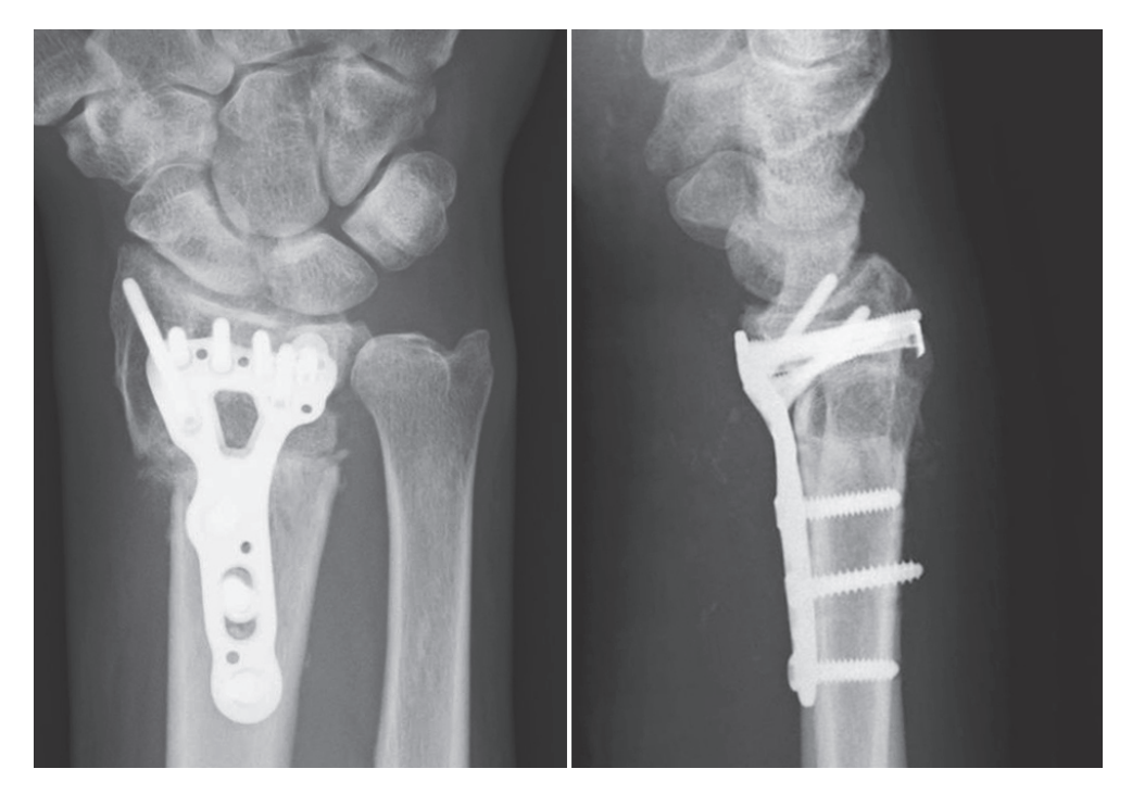
Fig. 5 Posteroanterior and lateral radiographs showing debridement of the nonunion, autogenous inlay bone grafting, and internal fixation with another volar locking plate system, which were performed at our hospital.