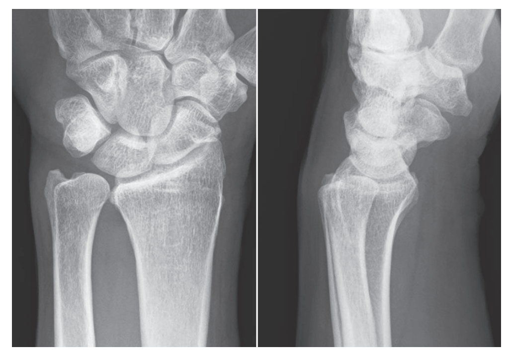
Fig. 4 Posteroanterior and lateral radiographs of the unaffected wrist showing 3.5-mm ulnar plus variance.

short arm cast for 3 weeks. He was referred to our hospital because of prolonged right wrist pain for 5 months postoperatively. On initial examination, there was palpable crepitus on the volar aspect of the wrist with an active thumb or other fingers motion. The range of motion of his right wrist was 59% of that of the contralateral side, and his right grip strength was 8 kg. He was not a smoker, and he had no comorbidities such as diabetes, peripheral vascular disease, alcoholism, and obesity. There was no history of previous pain or injury to either side of the wrist. Radiographs of the right injured wrist showed nonunion of the distal radius with 1.5-mm ulnar minus variance and prominence of the volar plate at the watershed line (Figure 3A). A computed tomography scan showed segmental bone defects in the distal radius and sclerotic changes at the fracture edges (Figure 3B). Radiographs of the left unaffected wrist showed 3.5-mm ulnar plus variance (Figure 4).