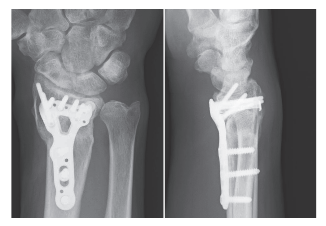
Fig. 6 Posteroanterior and lateral radiographs showing healing of the nonunion at 3 months postoperatively.

Fig. 5 Posteroanterior and lateral radiographs showing debridement of the nonunion, autogenous inlay bone grafting, and internal fixation with another volar locking plate system, which were performed at our hospital.