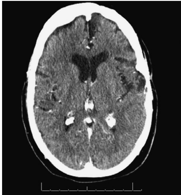
Fig. 3 Third year follow up CT head with contrast demonstrating no recurrence of the cystic mass at the surgical bed or anywhere else in brain.