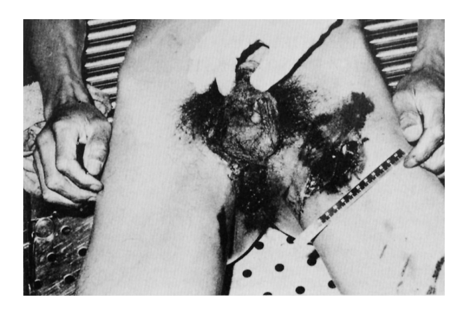
Fig. 1 Severe lacerations around the left inguinal region and the perineal region.