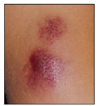
Figure 1: Skin involvement of BPDCN This patient presented dark red, nodular skin lesion (φ2cm).