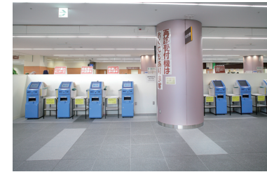
Automated Check-In Machine (1F)