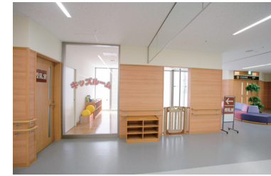
Children's Room (3F)