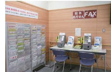
Out-of-Hospital Prescriptions (fax) (1F)