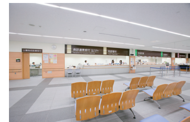
Central Waiting Hall (1F)