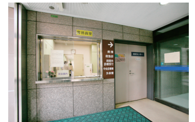
Disaster Prevention Center (1F)