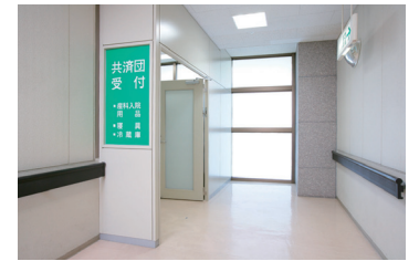
Kyosaidan Reception (2F)