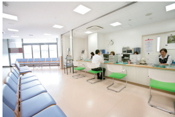
Reception for Hospital Admission and Discharge (1F)