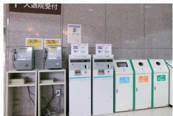
TV card vending machine and Public Telephone (1F)