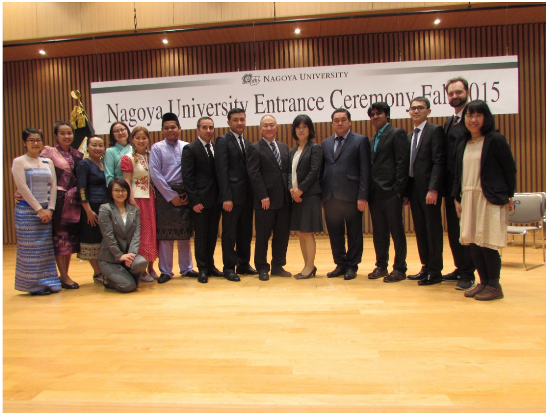
第 13 期生 : Class of 2015-16