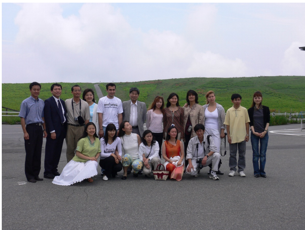
第2期生： Class of 2004-05