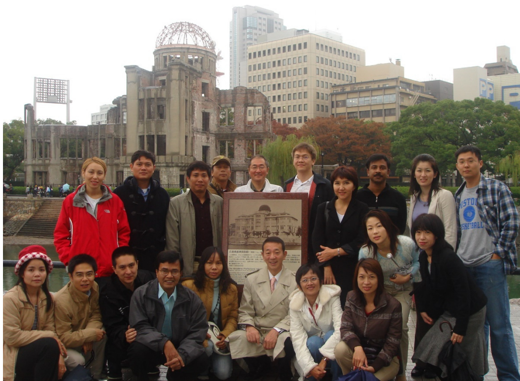
第 4 期生： Class of 2006-07