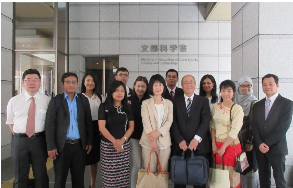
第 15 期生 : Class of 2017-18