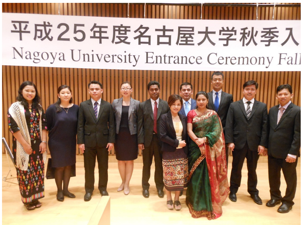
第 11 期生 : Class of 2013-14