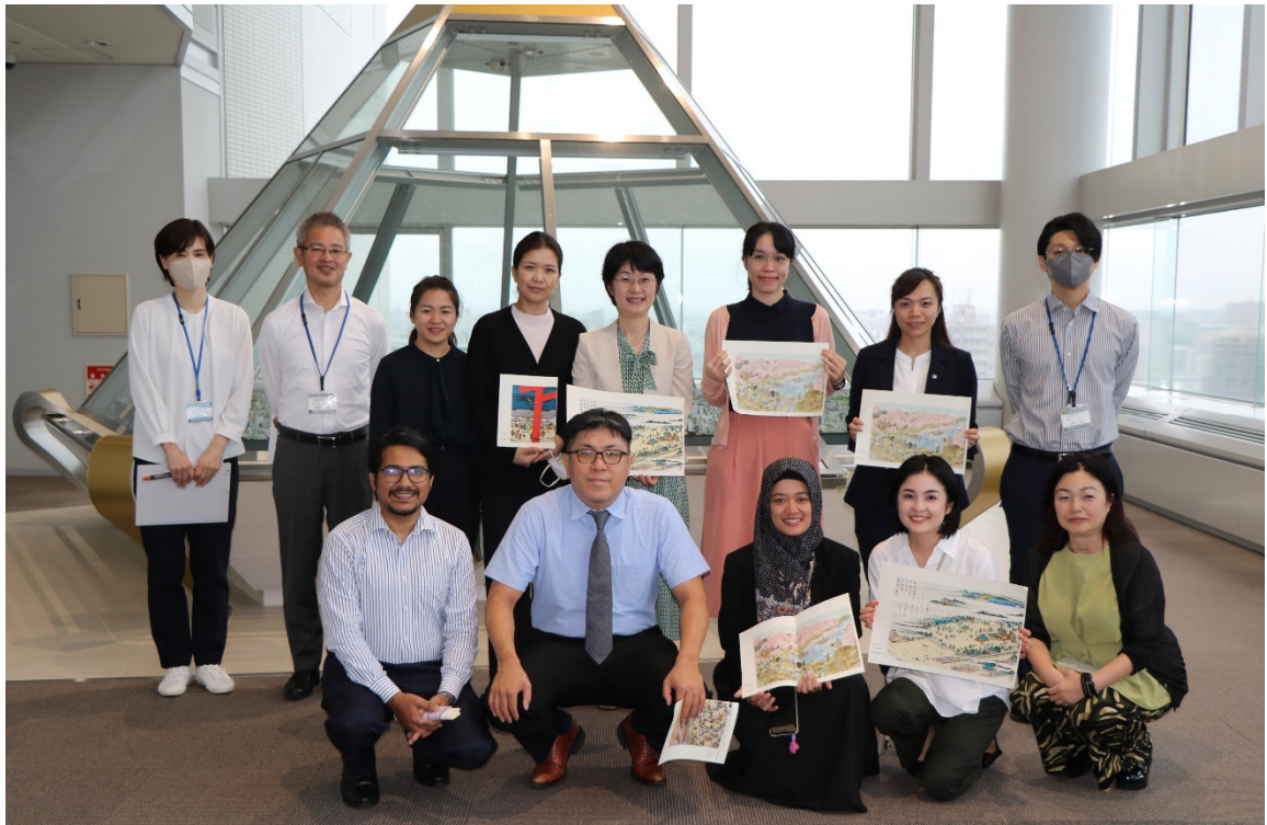
第 21 期生 : Class of 2023-24