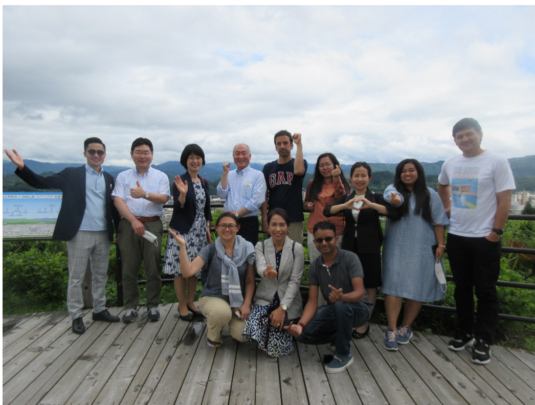
第 17 期生 : Class of 2019-20