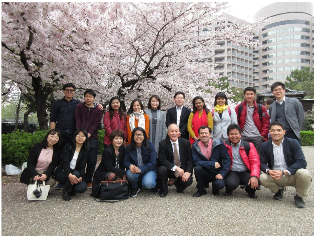
第 14 期生 : Class of 2016-17