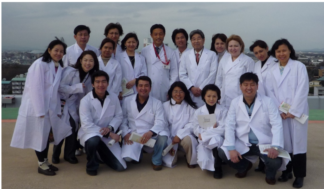
第 6 期生： Class of 2008-09