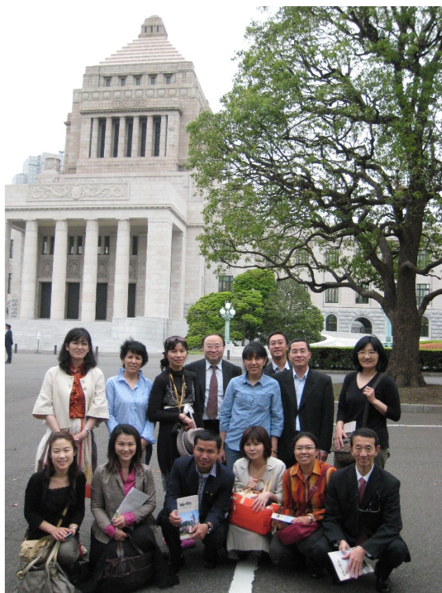
第 7 期生： Class of 2009-10