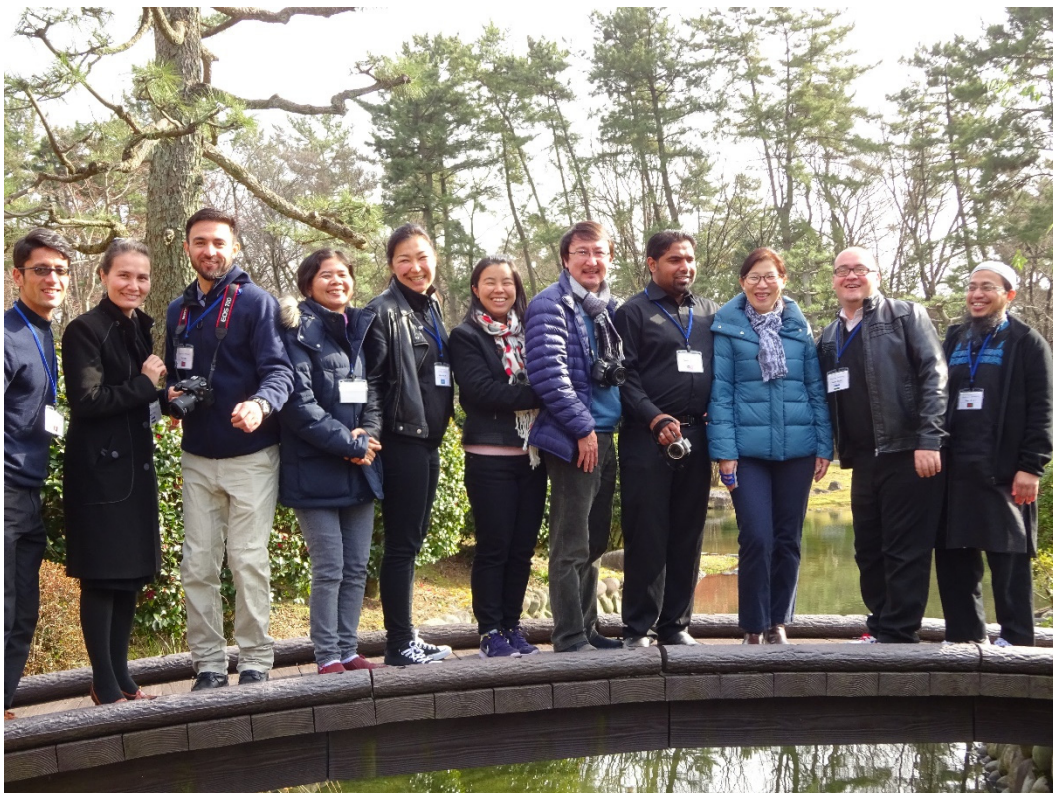
第 12 期生 : Class of 2014-15