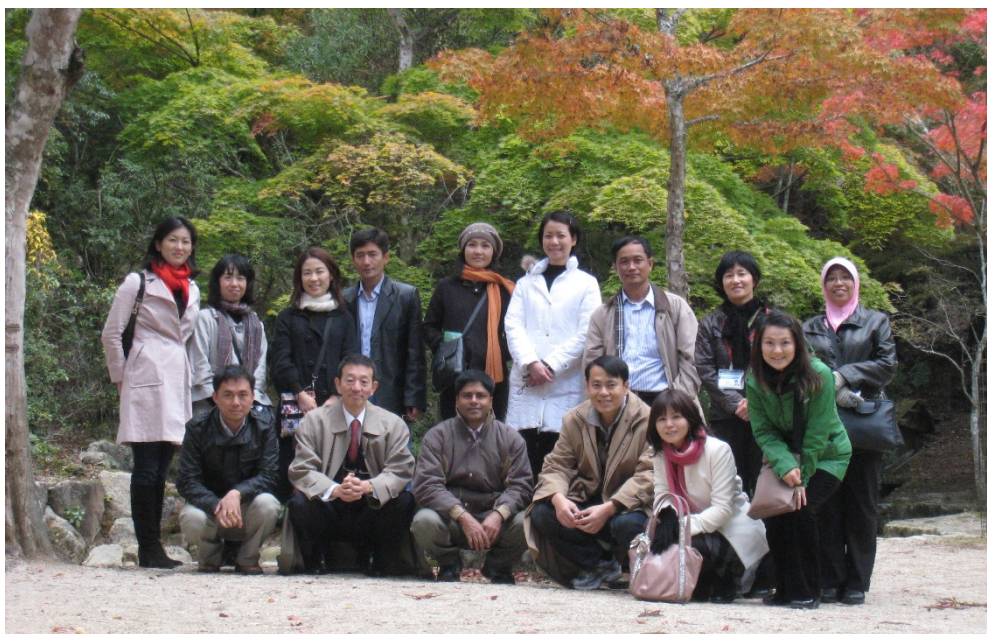
第 8 期生： Class of 2010-11