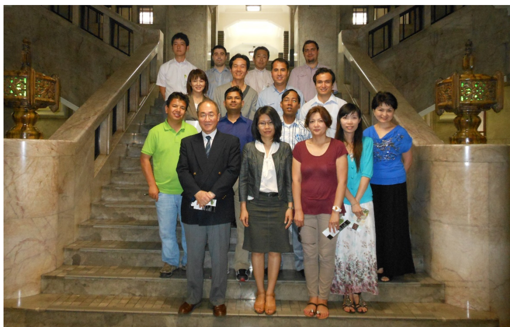
第 10 期生： Class of 2012-13