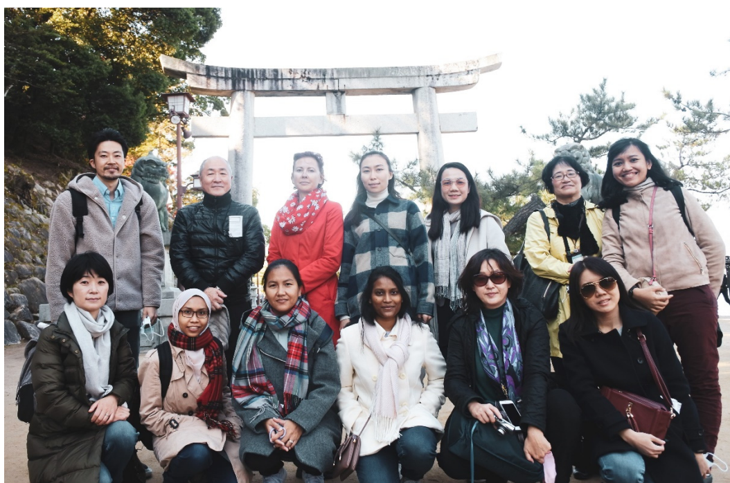
第 18 期生 : Class of 2020-21