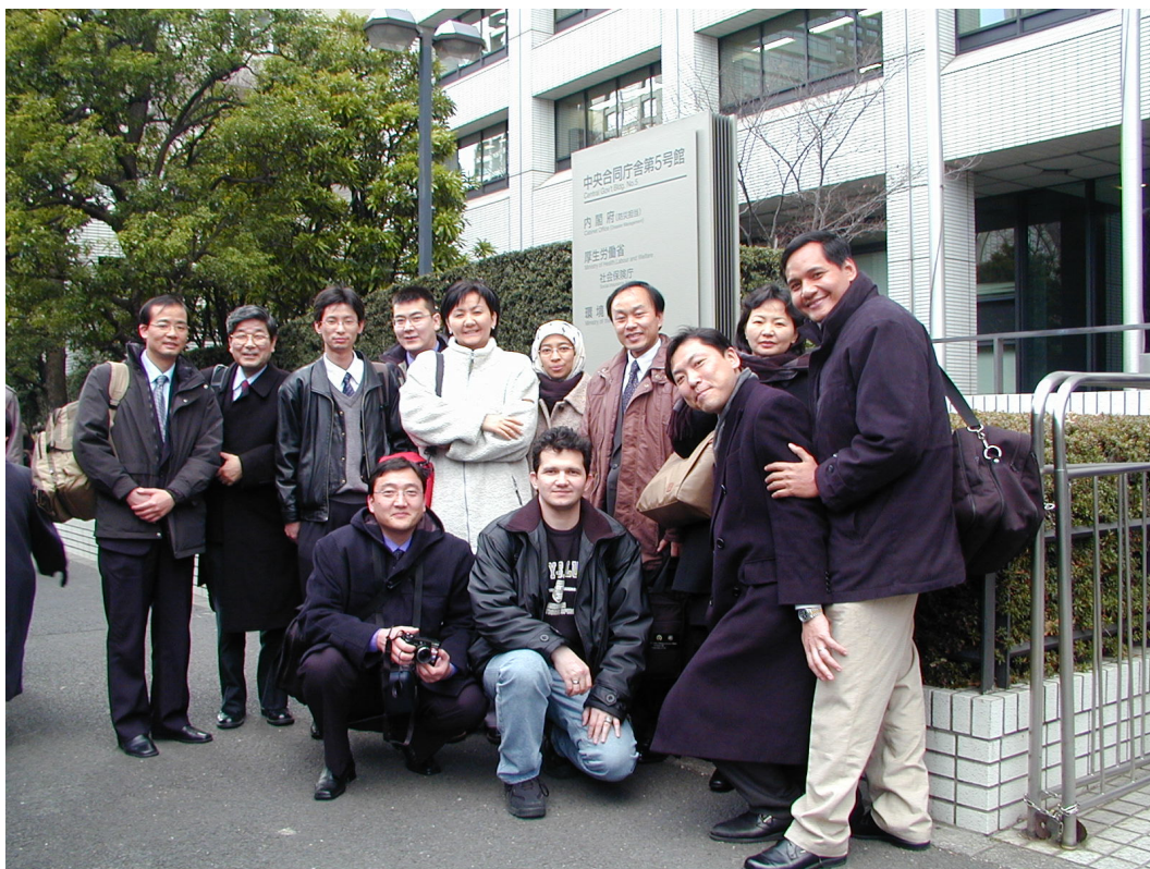
第1期生： Class of 2003-04