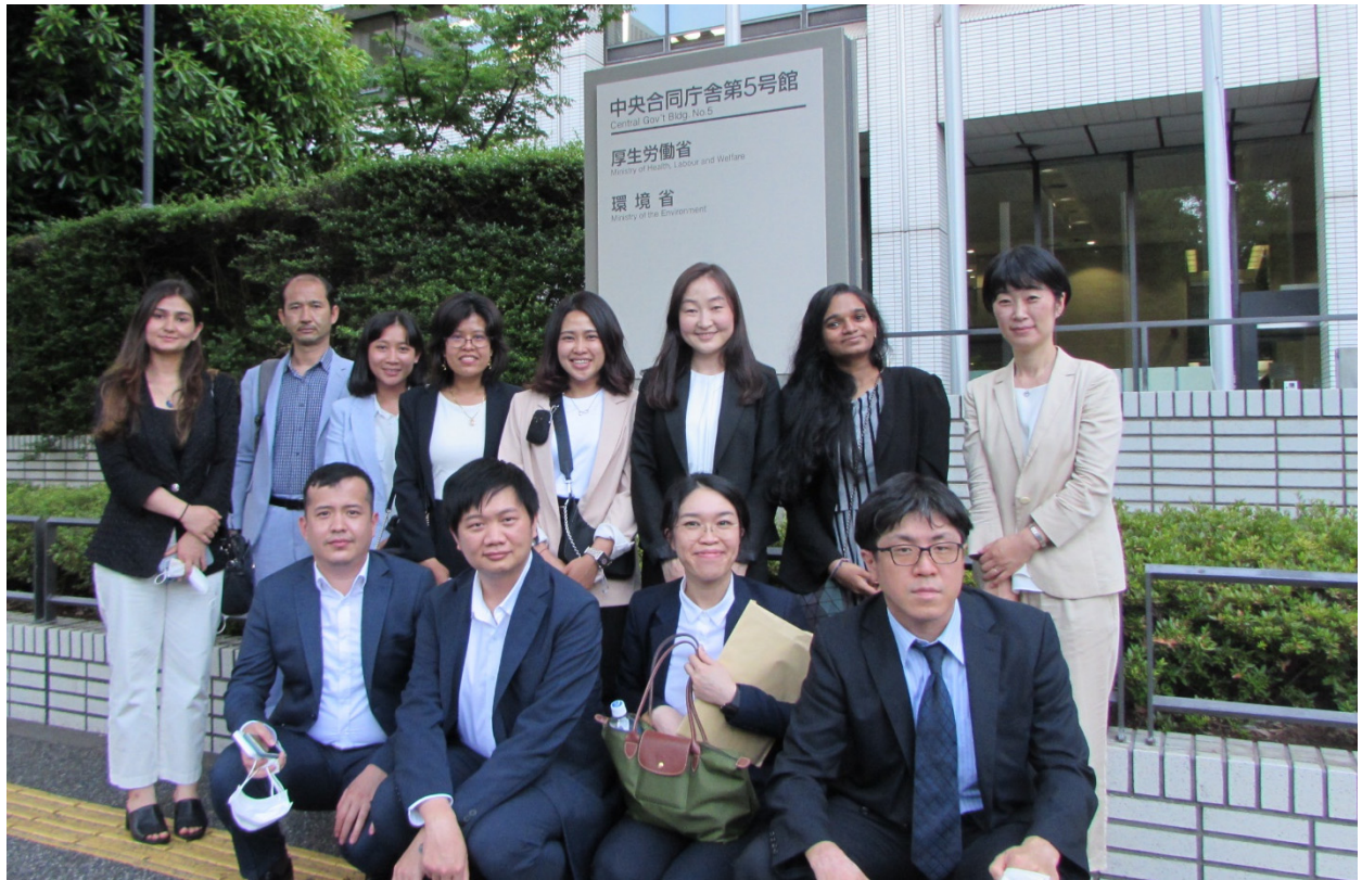
第 19 期生 : Class of 2021-22