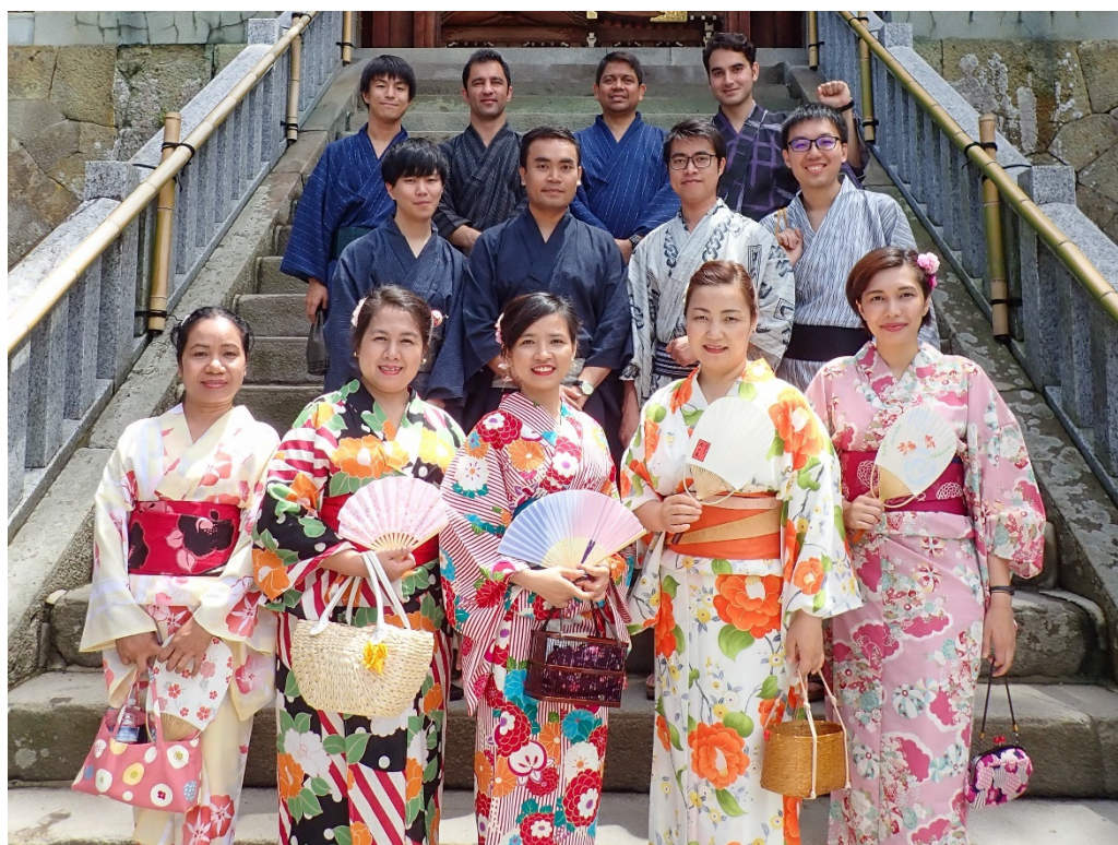
第 16 期生 : Class of 2018-19