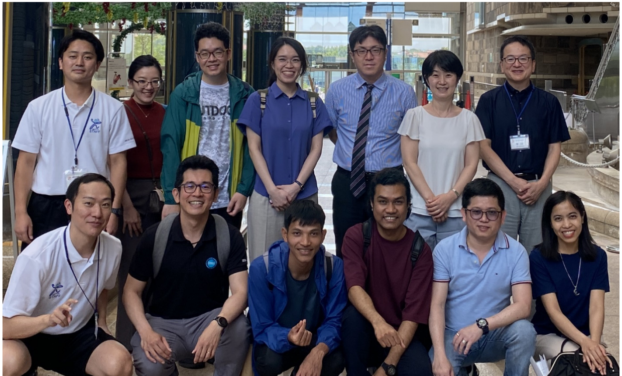
第 20 期生 : Class of 2022-23