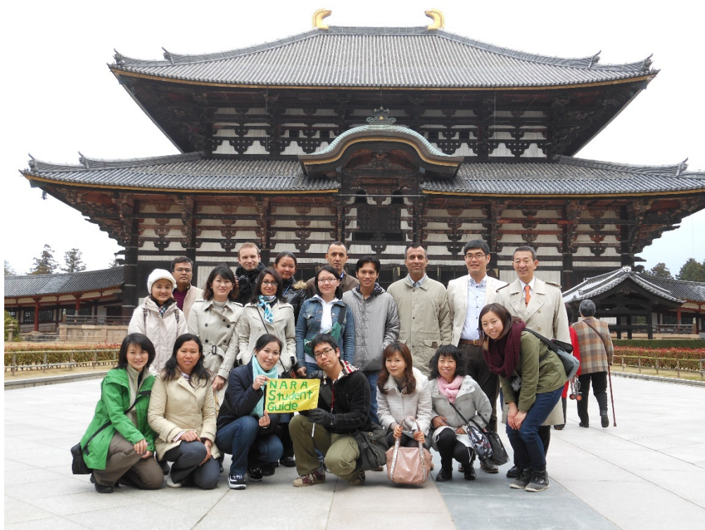
第 9 期生： Class of 2011-12