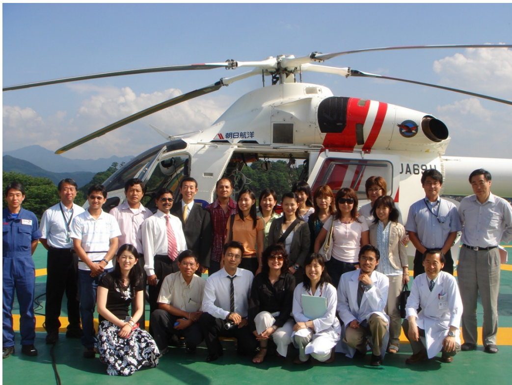
第 5 期生： Class of 2007-08