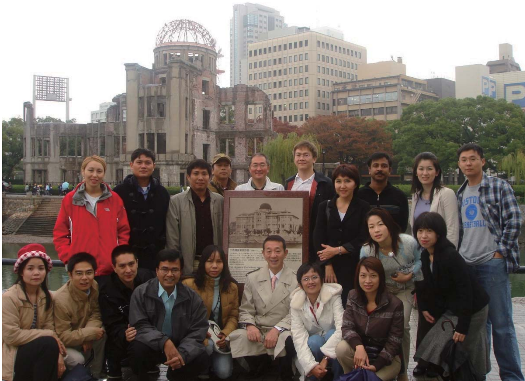
第 4 期生： Class of 2006-07