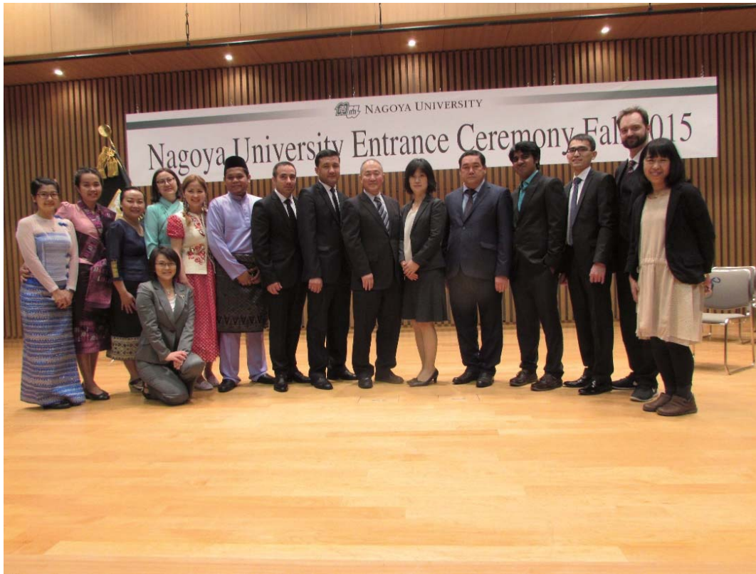
第 13 期生 : Class of 2015-16