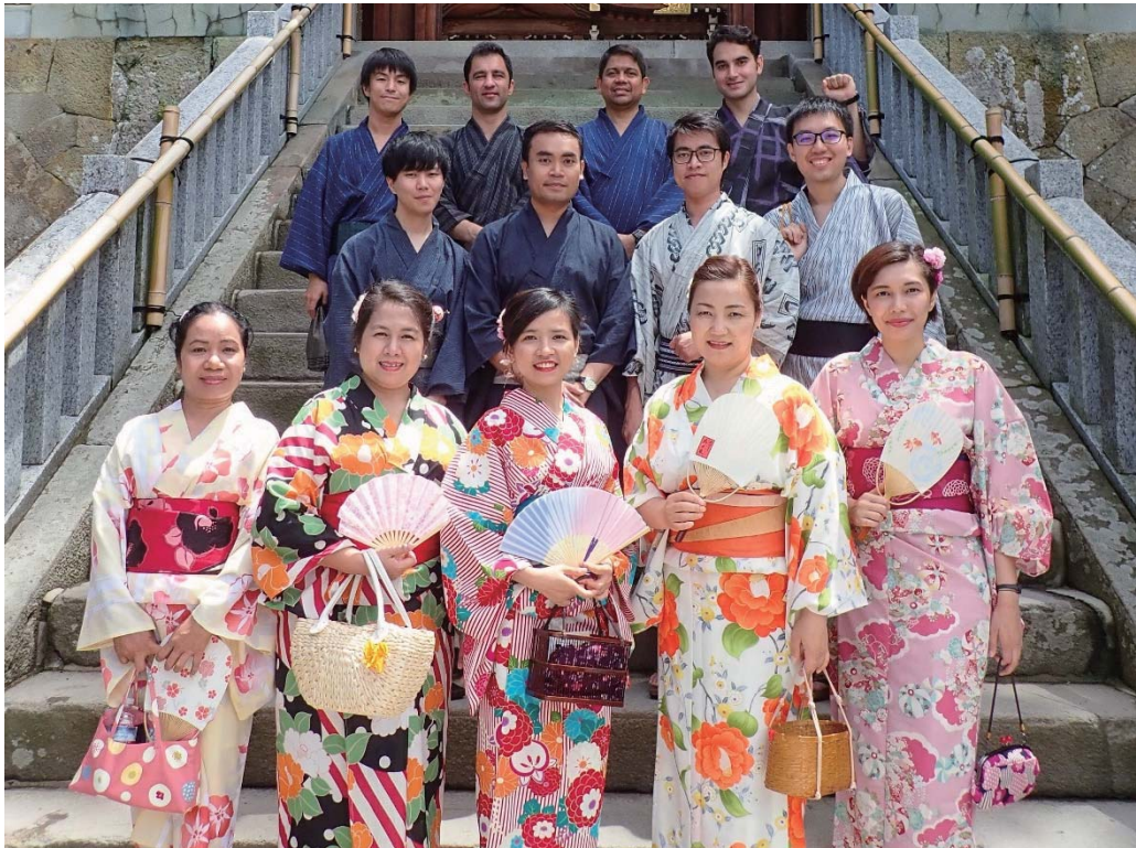
第 16 期生 : Class of 2018-19