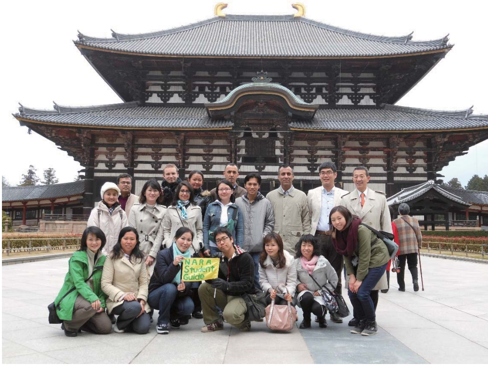
第 9 期生： Class of 2011-12