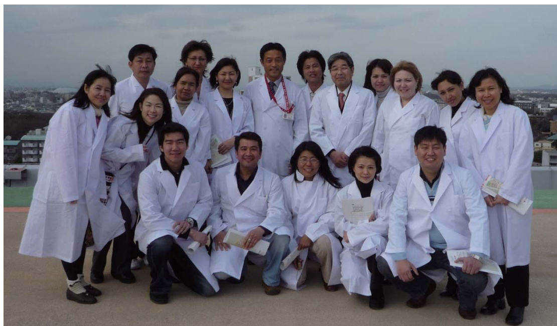
第 6 期生 : Class of 2008-09