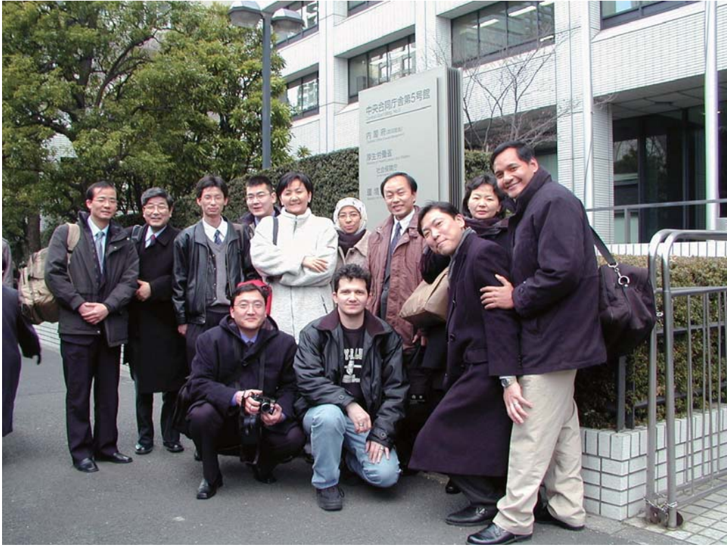
第1期生： Class of 2003-04