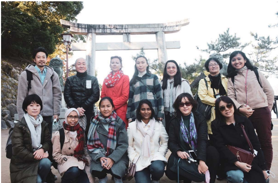
第 18 期生 : Class of 2020-21