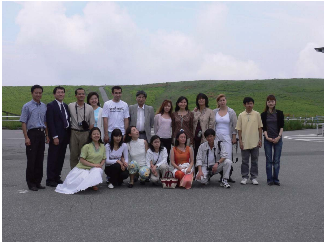
第2期生： Class of 2004-05