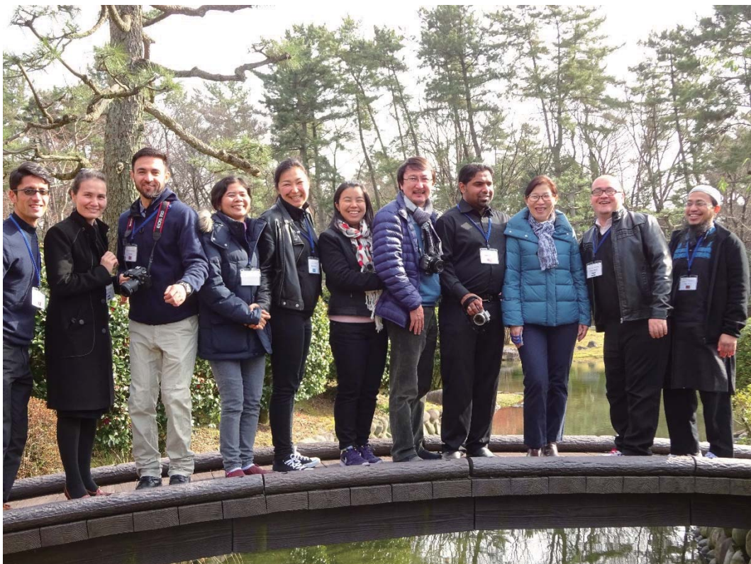
第 12 期生 : Class of 2014-15