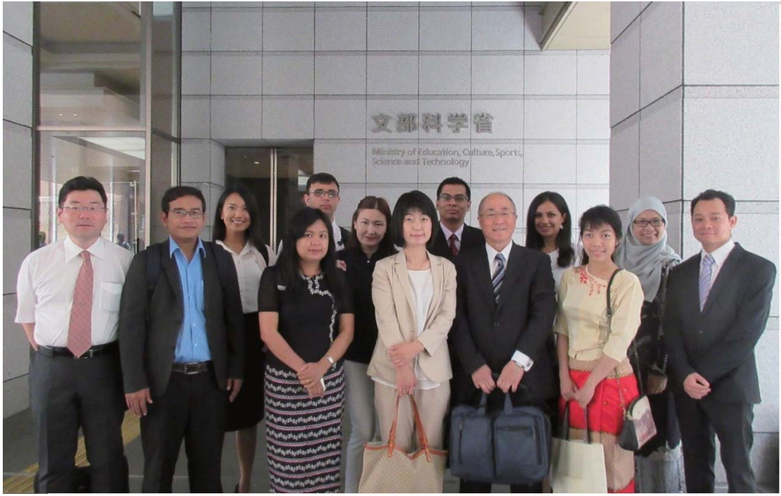
第 15 期生 : Class of 2017-18