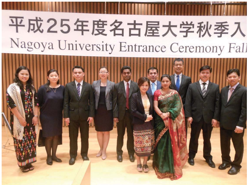
第 11 期生 : Class of 2013-14