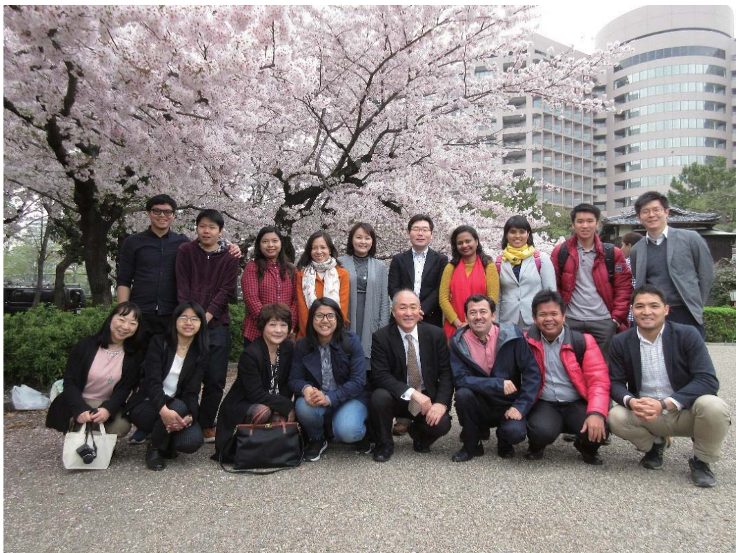
第 14 期生 : Class of 2016-17