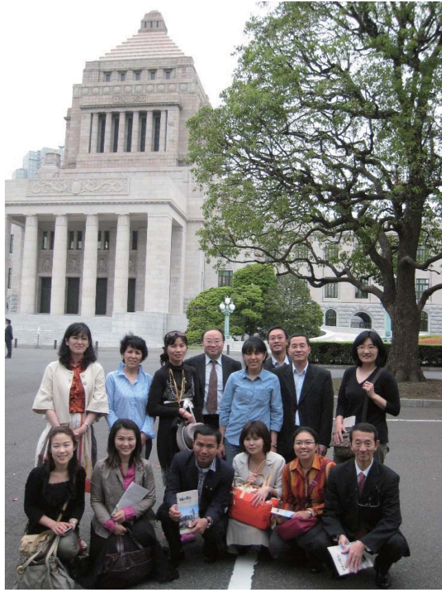
第 7 期生 : Class of 2009-10