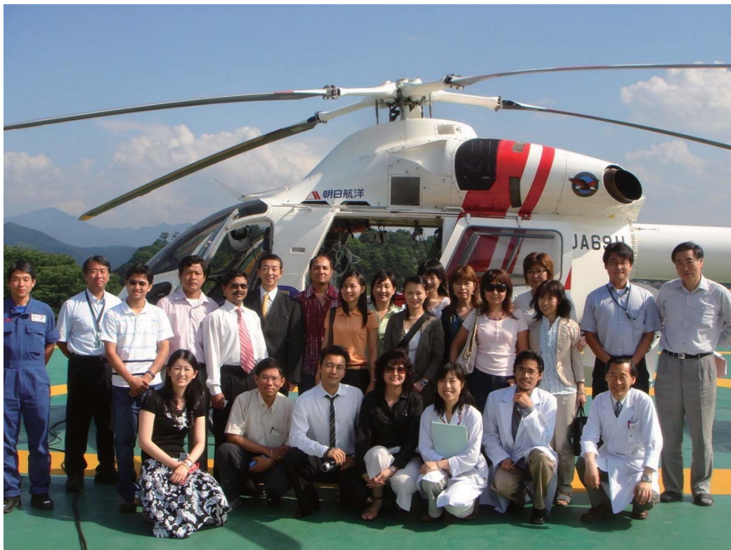
第 5 期生 : Class of 2007-08