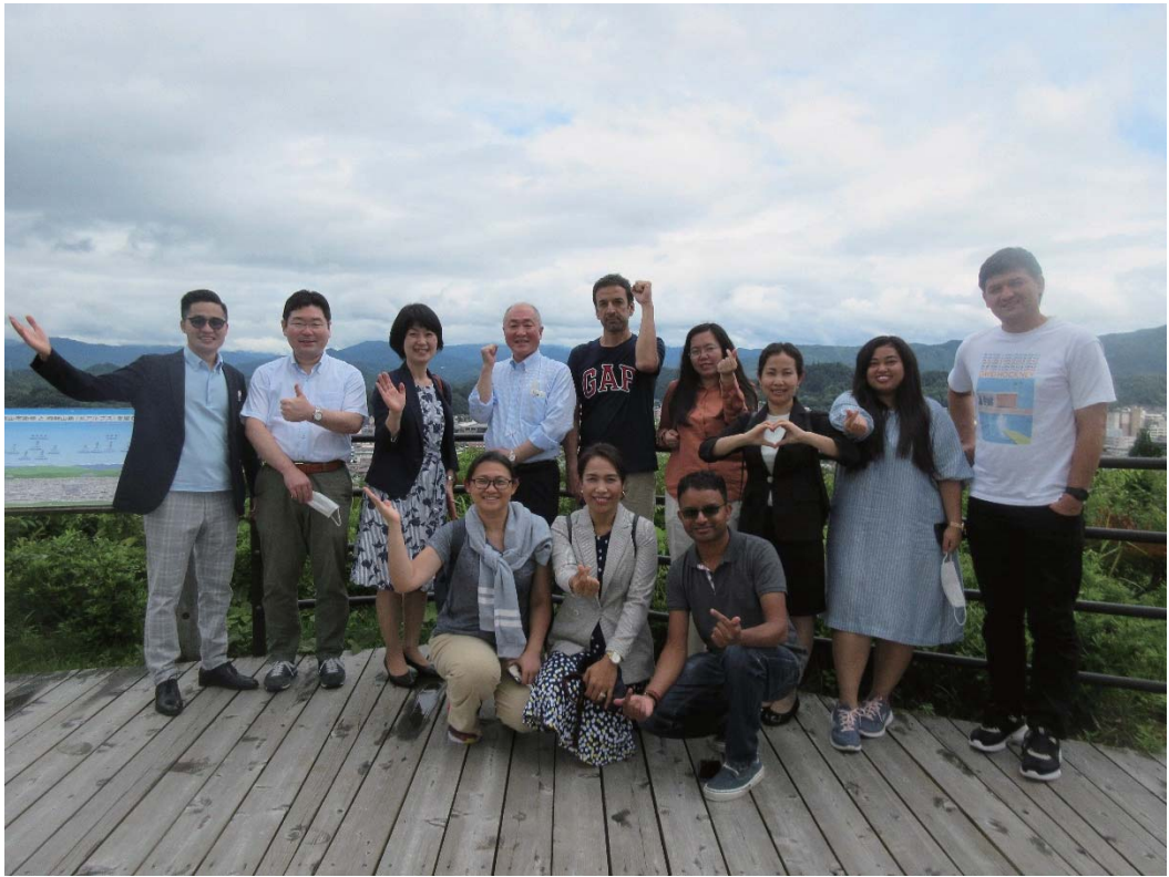
第 17 期生 : Class of 2019-20