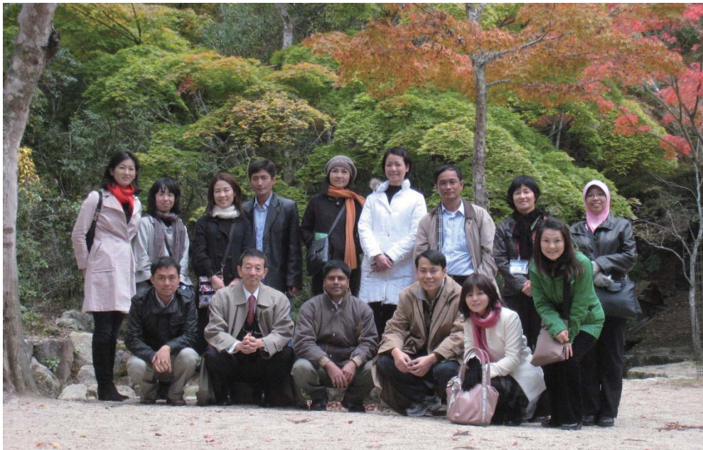
第 8 期生 : Class of 2010-11