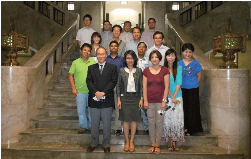
第 10 期生： Class of 2012-13