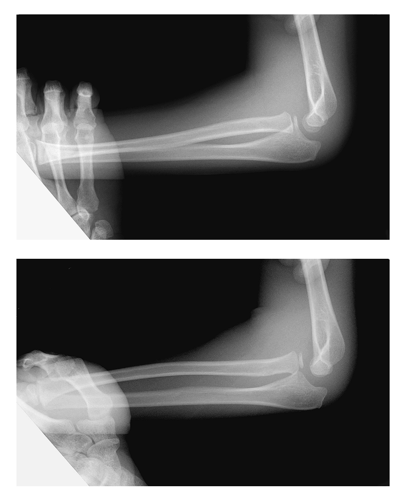
Fig. 3 Case 1, a 6-year-old boy. Lateral radiographs of the left forearm after closed reduction. A) The radial head was reduced in a supination position. B) The radial head was redislocated during rotation from neutral to a pronation position.

Restriction of elbow extension was gradually decreased, 10 degrees for every 3 days, under