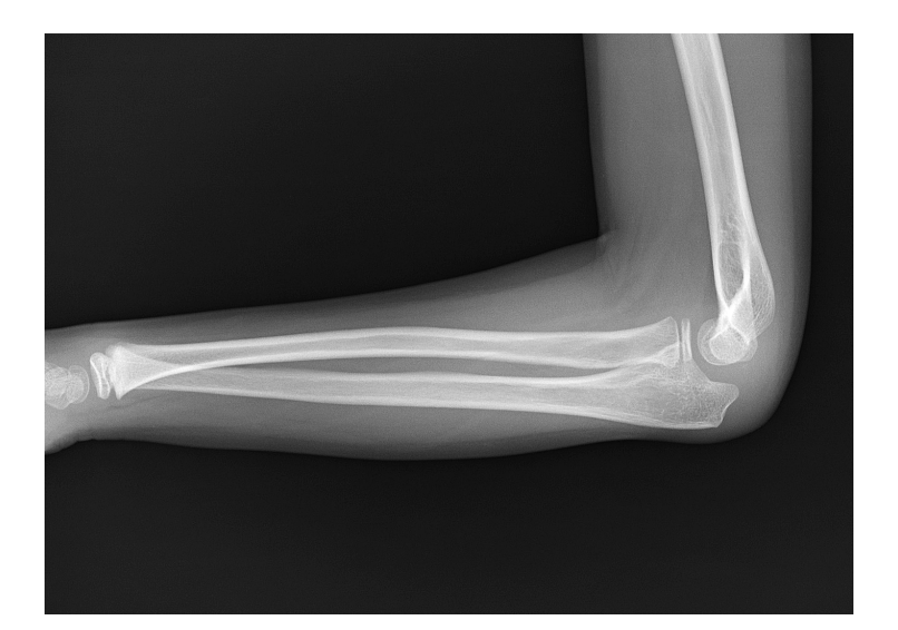
Fig. 5 Case 1, a 6-year-old boy. Lateral radiographs of the left forearm at 2 years and 3 months after injury, showing that the radial head was reduced in a pronation position.

positions on plain radiography (Fig. 5). The clinical outcome was excellent, as rated by Kim's elbow performance score<sup>6</sup>.