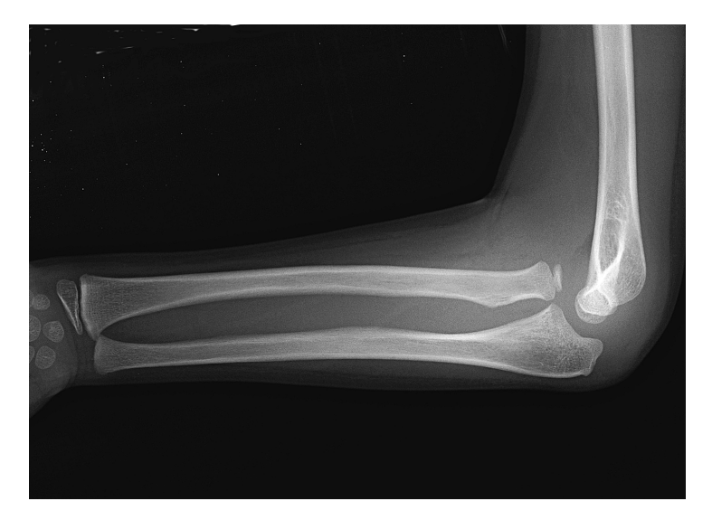
Fig. 1 Case 1, a 6-year-old boy. Lateral radiograph of the left forearm showing anterior dislocation of the radial head with plastic bowing of the ulna.

A 6-year-old boy was referred to our hospital due to incomplete reduction of the radial head. He had fallen down over an outstretched arm 8 days earlier. He had been diagnosed with radial head dislocation with plastic bowing of the ulna at a local hospital and reduction had been performed under general anesthesia on the same day. Plain radiography at the time of injury showed the radial head dislocated anteriorly and the ulna had a bowing deformity (Fig. 1). The ulnar bow rates<sup>4</sup>) (the ratio of the maximum ulnar bow<sup>5</sup>) divided by the ulnar length;