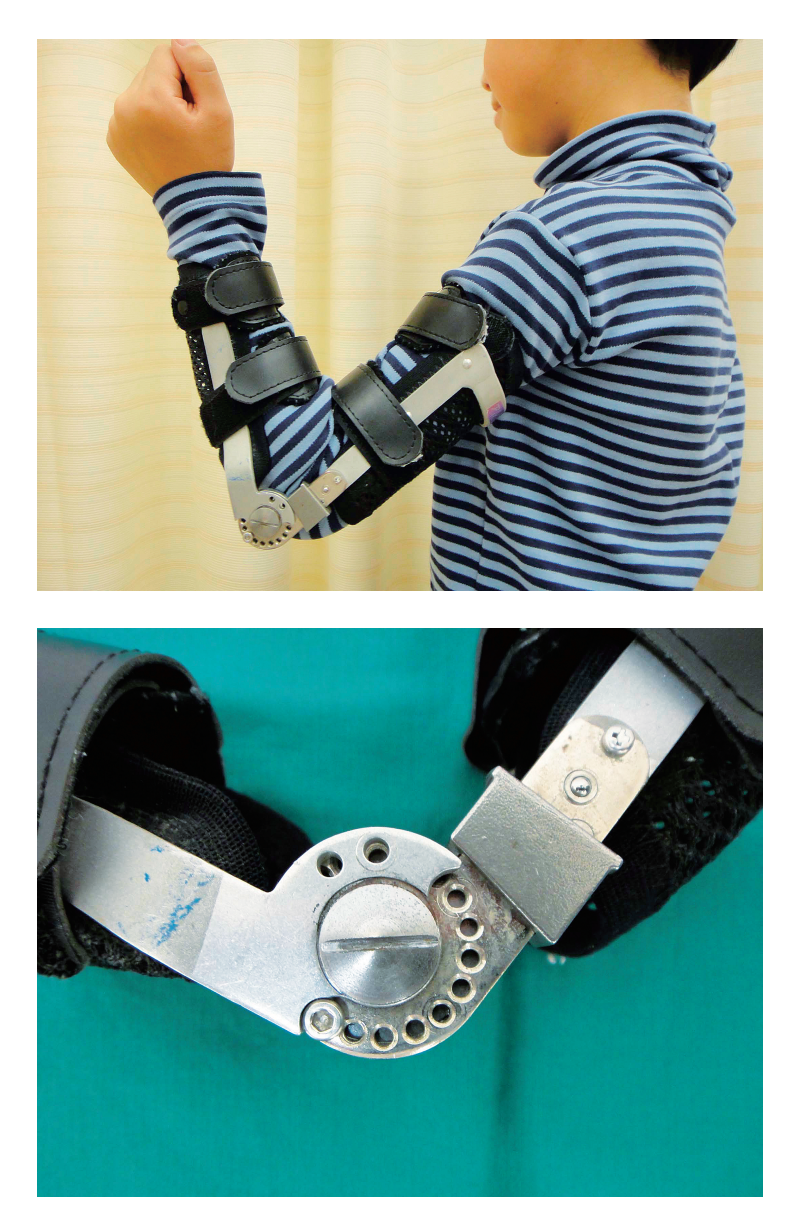
Fig. 4 Case 1, a 6-year-old boy. A) Photograph showing active range of motion exercises performed while wearing an adjustable hinged elbow splint that limits elbow extension.B) Photograph showing a hinge that can selectively control the range of elbow motion.

the control of the hinged splint. The patient was controlled to wear the splint all day for the first 4 weeks except bathing, and to hold the arm in 90 degree of flexion while bathing. Elbow extension reached full extension by 4 weeks after the commencement of exercise, then splinting was continued additional 2 weeks for prevention of elbow hyperextension. The splint was removed at 6 weeks. Plain radiography at 7 weeks after injury showed that the radial head was reduced in the full arc of pronation-supination motion. At 2 years and 3 months after injury, the patient had no pain and a full range of motion, and the radial head was reduced in all