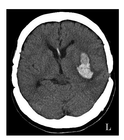
Fig. 1 Brain CT scan 2 days after second admission. It showed left putaminal hemorrhage.

In bypass surgery for moyamoya disease, rebleeding was less likely to occur in patients who had undergone bypass or some other revascularization surgery.<sup>1)</sup> The rebleeding rate was